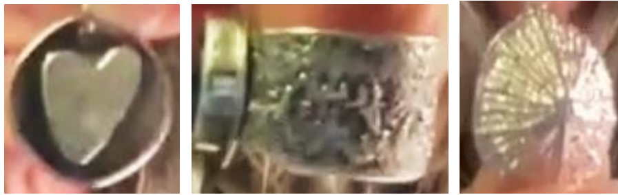
A simple pendant from fused sheet metal, a ring band made with reticulated scrap pieces, and a sand casted pendant made by Janet Borzecki.

Depletion gilding is an alternative heating technique. Heat, pickle, and brass brush a sheet of metal, then flux it with scrap pieces. Heat from underneath to fuse the scraps, maybe even including bits of leftover chain. There may be pieces that do not fuse, so just brush them off; they may leave behind an indentation. Then you can put the whole piece through a rolling mill, if you want.