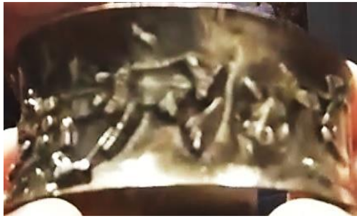
Examples of collages shown during the meeting. On the left is a pendant of fused scraps made by Joy McDonnel. On the right is a cuff bracelet made by Tanya McCormick. Below is a pendant made with granulation technique by Tanya McCormick.

Go through your scrap and find off-cuts and plates that are interesting to you. With these odd shapes as a base, you will often end up with asymmetrical designs and unique pieces.