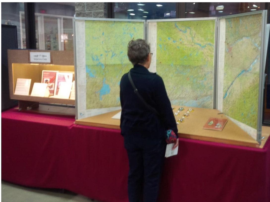
Below: A visitor enjoys an interactive display of mineral sites.